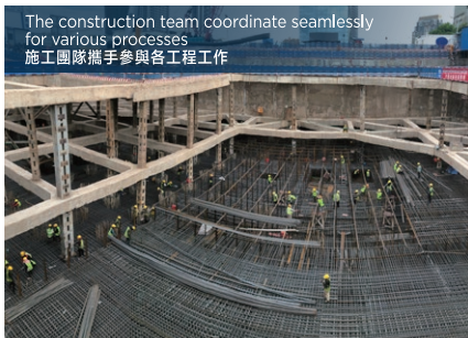
The construction team coordinate seamlessly for various processes 施工團隊攜手參與各工程工作

The MESONG professional construction team and the main contractor Shanghai Baoye, one of the largest state-owned enterprises in China, are determined to conduct the construction of MESONG in full speed by diligently working towards the highest international building quality standard. With the efforts of all professional parties, raft rebar bundling is assembled and building up layer by layer. Each bundle is processed smoothly according to the approved drawings