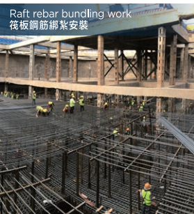
Raft rebar bundling work 筏板鋼筋綁紮安裝