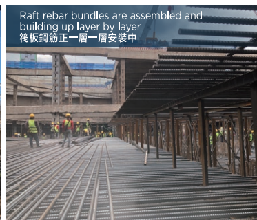
Raft rebar bundles are assembled and building up layer by layer 筏板鋼筋正一層一層安裝中